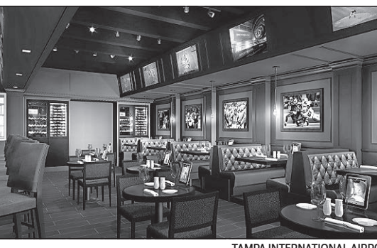
AIRPORT, Page 6

"The Gasparilla Bar" ship could anchor one end of a promenade on Airside F at the airport, and is one of the more colorful potential outcomes from an extensively complex vetting process airport staff is now considering for the planned $1 billion renovation of the terminals.