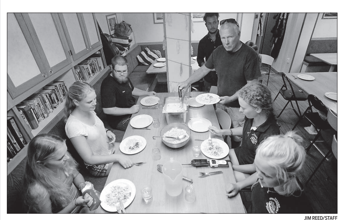
Swedish students, teachers and crew eat lunch in the galley of their floating school, the T/S Gunilla. The 42 students' vessel is moored behind the USS American Victory near The Florida Aquarium.