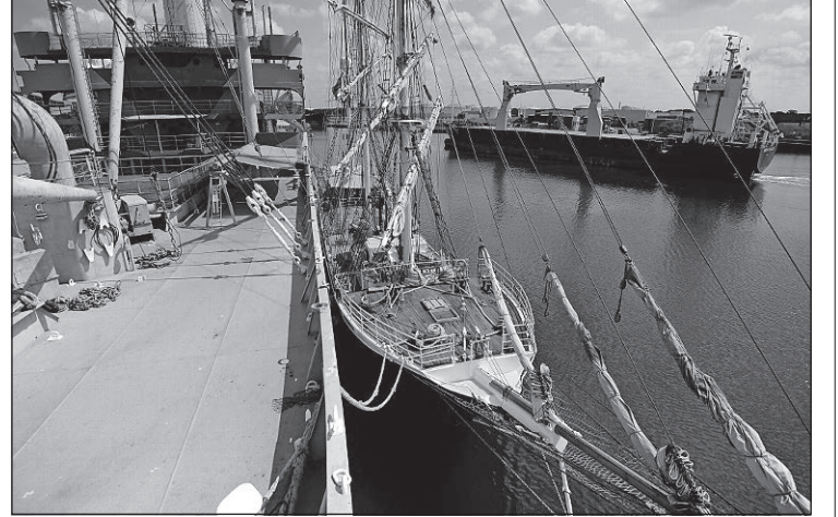
At home on a cluster of tiny The 162-foot T/S Gunilla began its existence as a dry bulk carrier and SHIP, Page 7 was converted into a tall ship and school.

Moored behind the USS American Victory near The Florida Aquarium, a 162-foot square rigger — a former dry bulk carrier turned tall ship — is temporary home to 44 Swedish students doing just that.